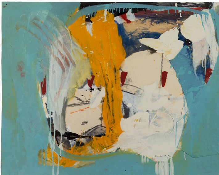
Helen Frankenthaler, Summer Picture (1959)

The Parrish Art Museum honors Helen Frankenthaler nearly a decade after her death with a close look at her work made between 1950 and 1971. On August 4, "Abstract Climates" opens in Water Mill, New York, featuring paintings that the late artist created during her time in Provincetown, MA. The exhibition includes both small-scale and monumentally-sized paintings that explore landscape and abstraction. PARRISHART.ORG