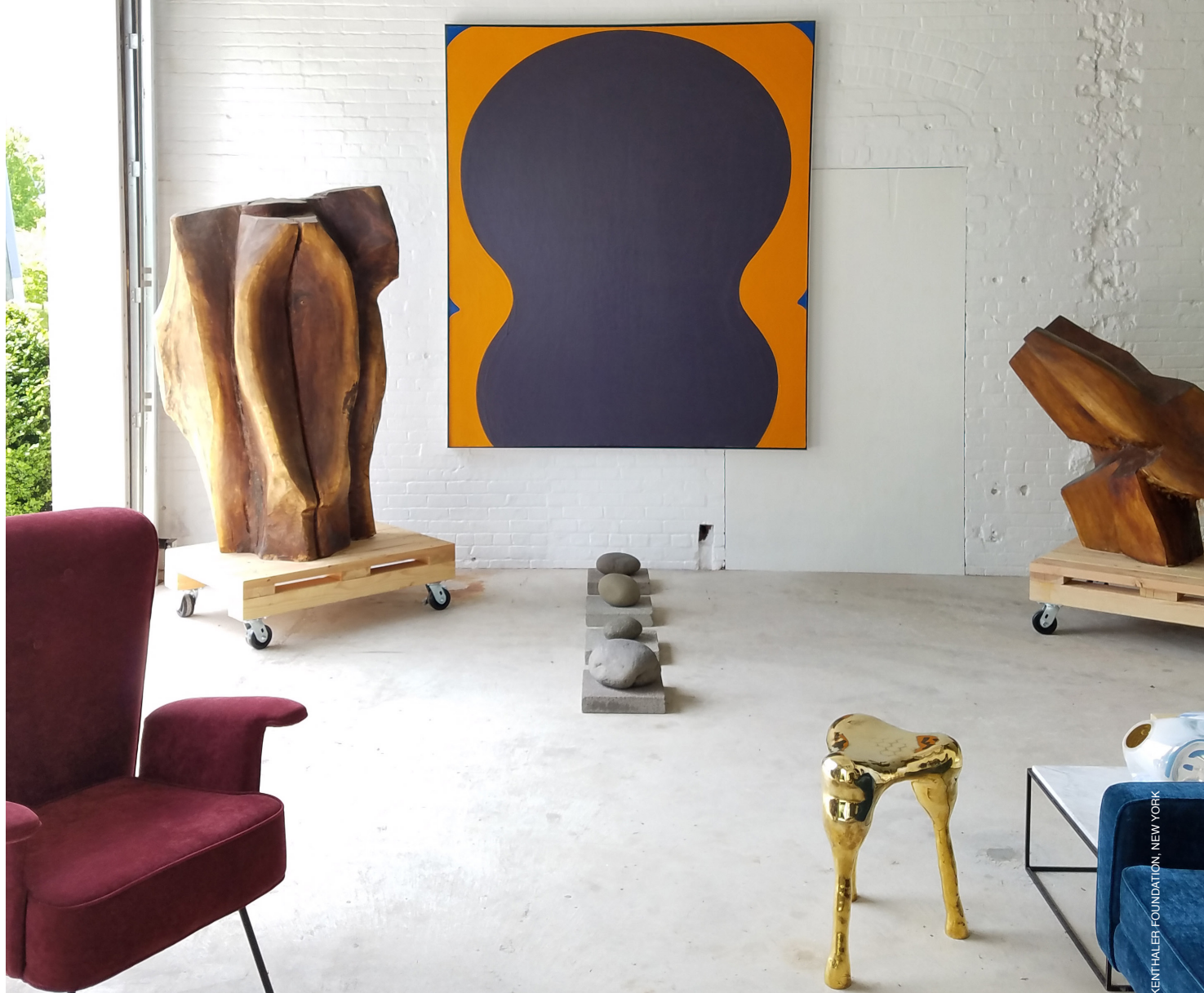
An installation view of "Al Held and Bram Bogart, Paintings 1959–1966"